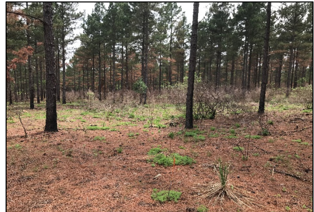
Mid-rotation loblolly pine stand, Marion County, 184 acres.