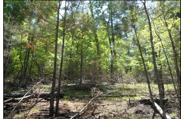
Mixed age loblolly pine stand, Houston County, 403 acres.