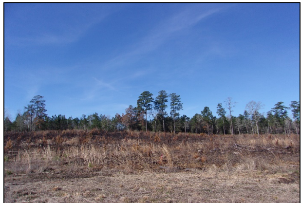
Young Longleaf Pine burned for release from grass stage, Tyler County, 201 acres.